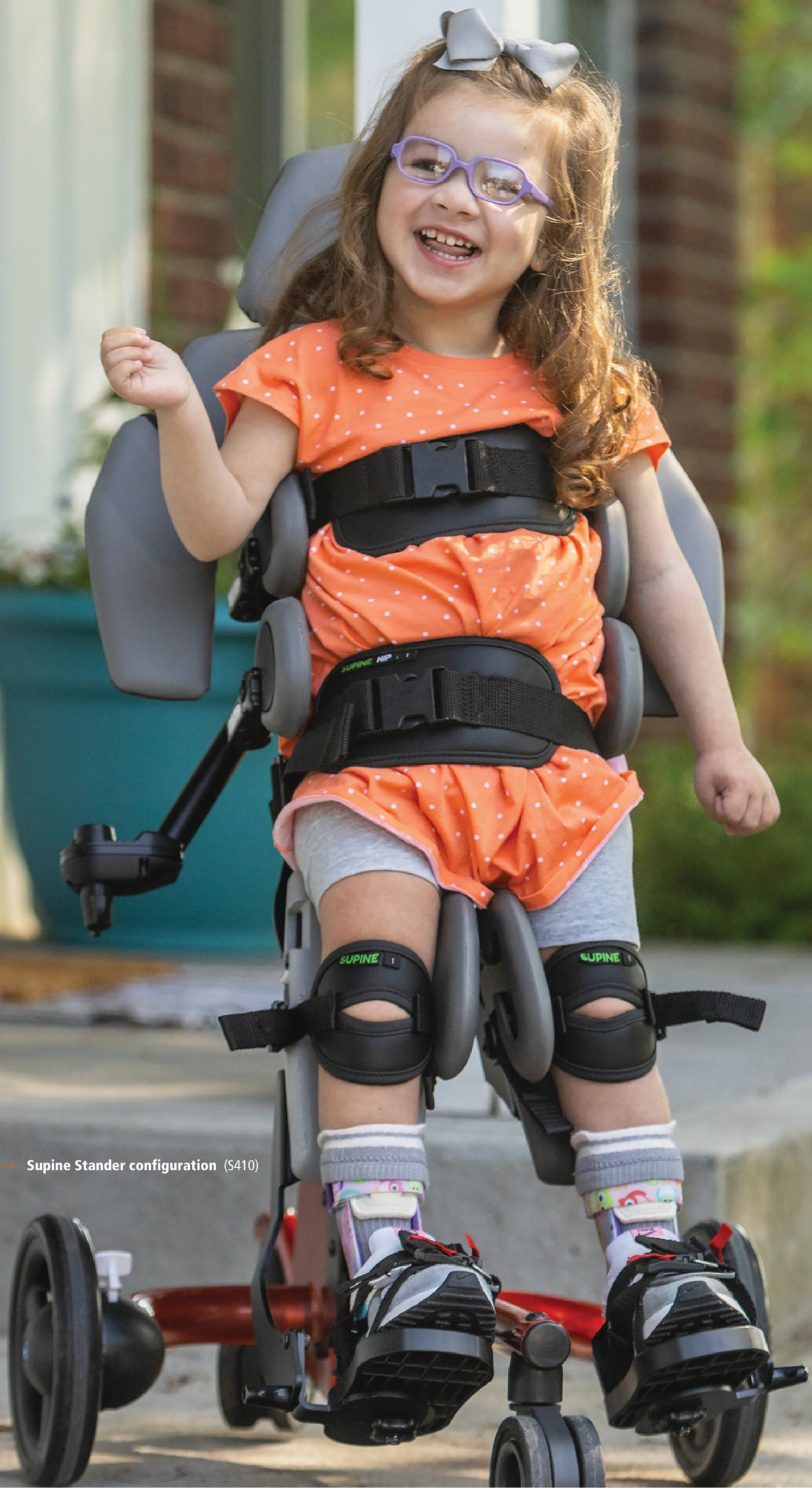
● ..... Supine Stander configuration (S410)