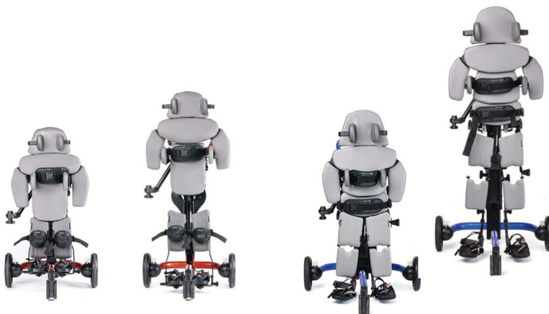
Size 1 range of adjustment